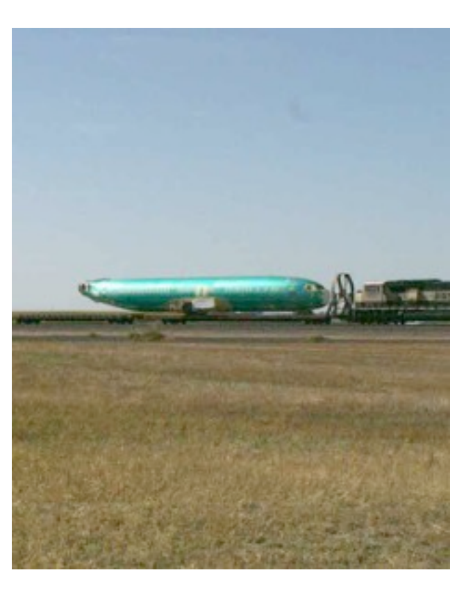
Boeing fuselage on a flat car in Wyoming. Fuselages are shipped from plant in Wichita, KS to factory in Washington